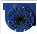
ISO5211 Actuator Mounting